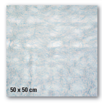
Four plus one for all surfaces: Four sizes of vacuum insulation panels and one cuttable cut-strip cover almost any surface quick, easy and flexible.