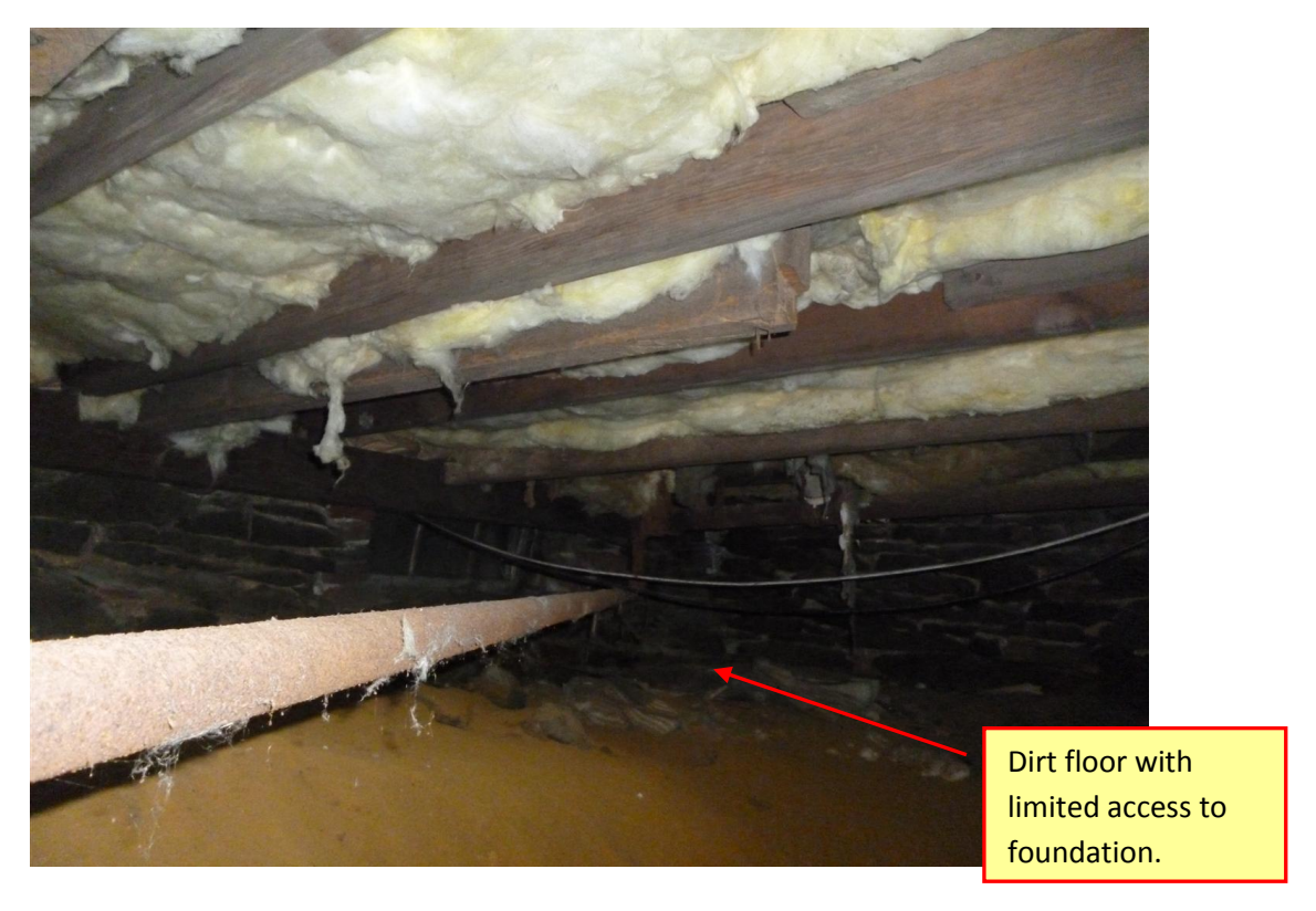
^{\wedge} Original section of the house showing additional low access areas under \mathbf{1}^{\text{st}} floor and with newer joists.