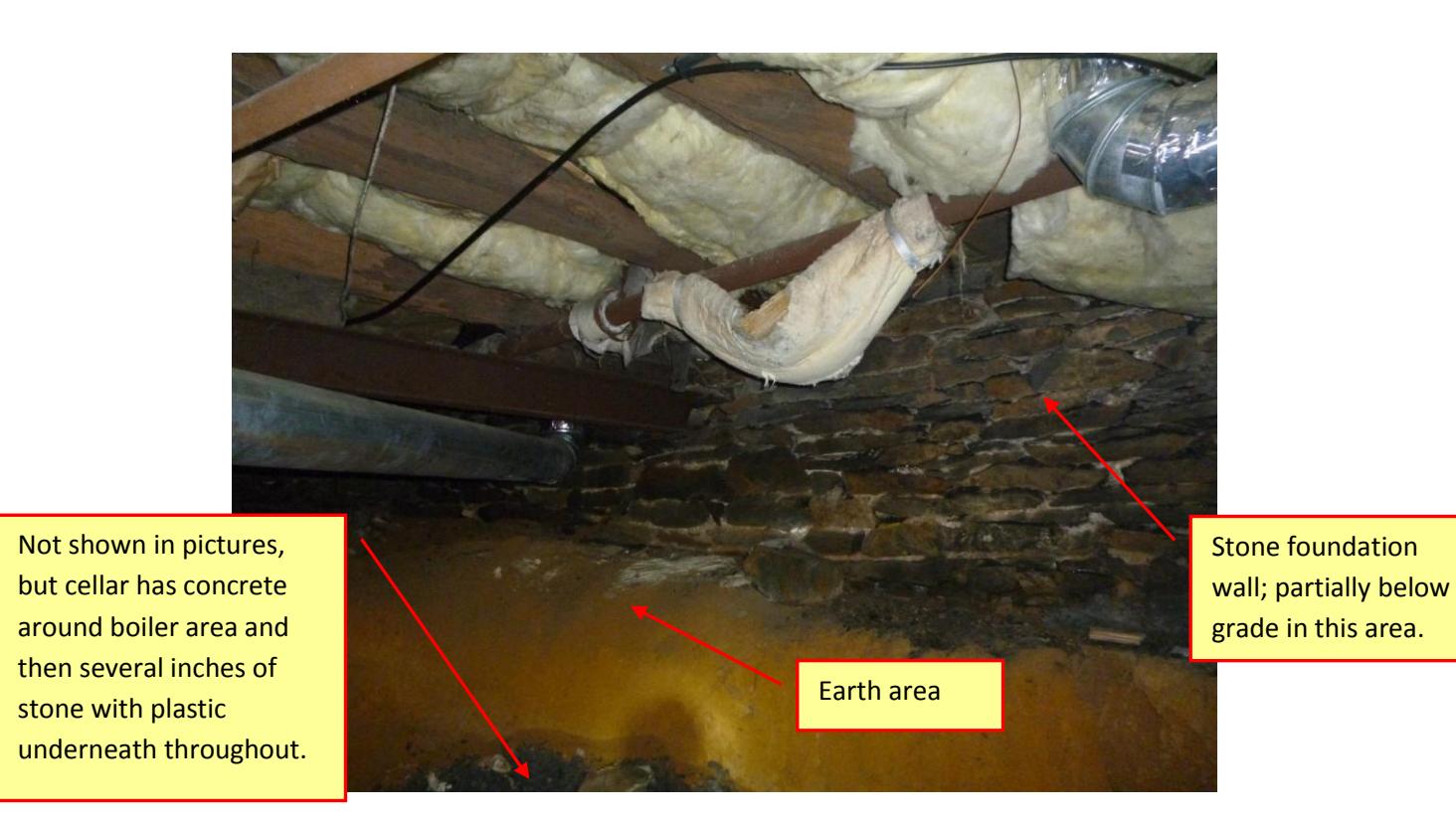
^ Original section of the house showing soil and stacked stone foundation and old log joists.