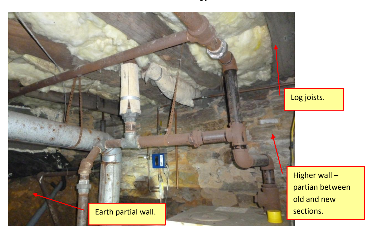
^ Original section of the house showing typical other wall with more vertical structure and also showing old log joists.