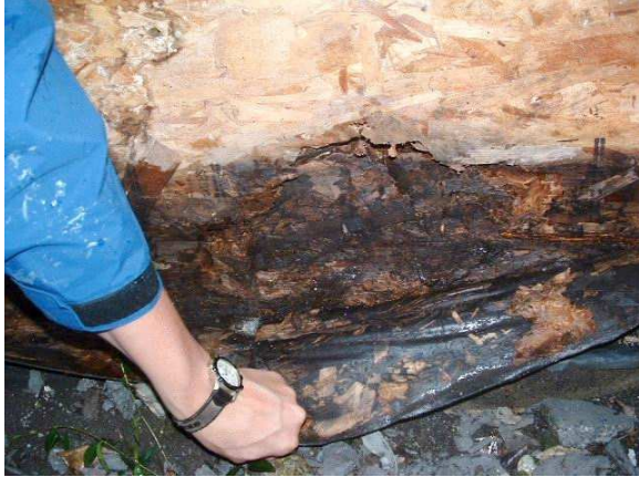
Adhered membrane base flashing restricts drying

detail should also have incorporated a concrete curb at the base of the wall so that the wood plate is elevated above the horizontal membrane level and minor leaks in the membrane will not saturate the wood framing.