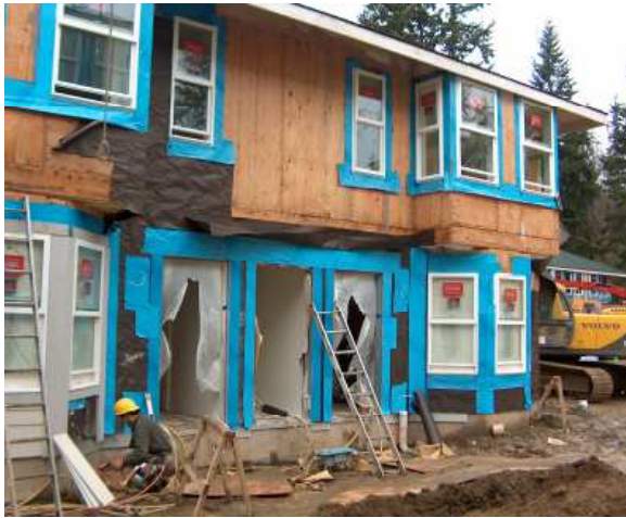
Extensive use of self adhesive membrane results in almost complete coverage of wall area on ground floor of this building

a particularly true with highly articulated facades that utilize a high percentage of glazing. The result is a relatively continuous vapor impermeable surface located on the cold side of the wall, potentially leading to a vapor diffusion related condensation problem. See ground floor level of building in photo below.