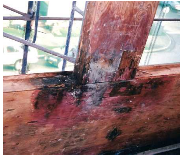
Decay worse under membrane location

The point of this discussion is not to emphasize the need to control water penetration (clearly this is important) as much as it is to emphasize the very sensitive nature of wood components of the building enclosure where drying is limited by self-adhered membrane.