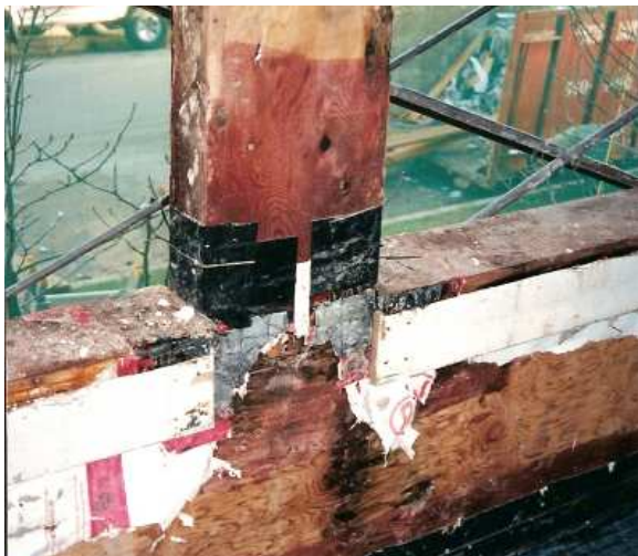
Membrane used at saddle detail

Another example of restricted drying and resultant decay is illustrated in the two photos that follow. The first photo indicates a detail prior to the removal of all of the self-adhesive membrane, while the second detail shows a similar detail (different location) that has localized decay immediately under the area where the membrane was adhered. In this case a leaky walkway above was the source of moisture to the wall but it is clear that the decay is more significant in the areas where drying was restricted.