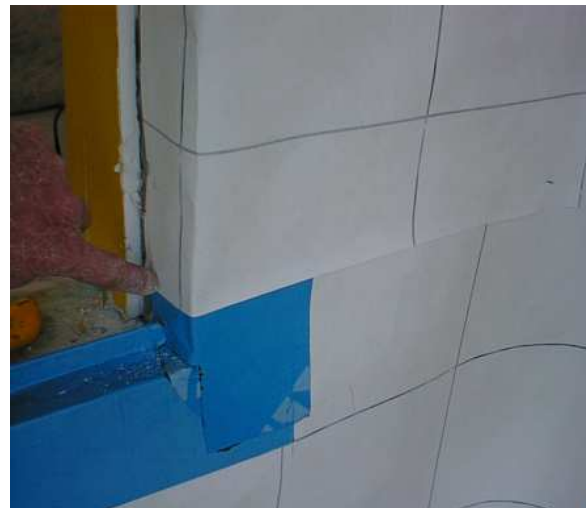
Appropriate use of membrane at window sill and jamb

The photo below shows an appropriate use of membrane at the sill of a window. It is adhered only on the sill surface (necessary to hold it in place) and laps over the sheathing paper. It also only extends 8" up the rough opening at the window jamb, with the sheathing paper lapping over the membrane.