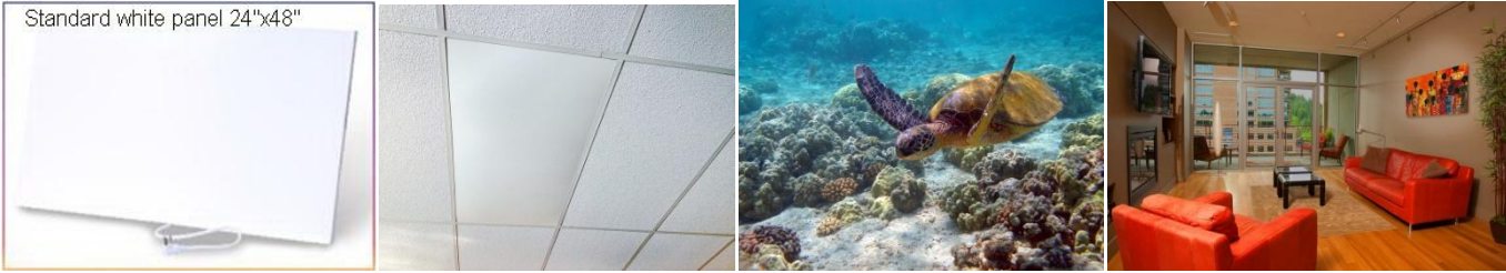
Standard white panel Panel mounted in suspended ceiling Decorative panel Decorative panel mounted on wall