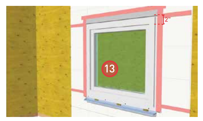
13. Install metal flashing at the head of the window. Seal the leading edge of the flashing with sheathing tape.