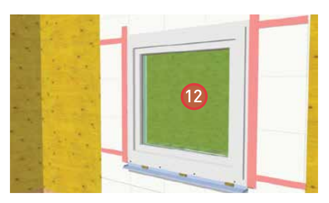
12. Install sheathing tape along the jambs of the window frame and extend to the face of the wall.