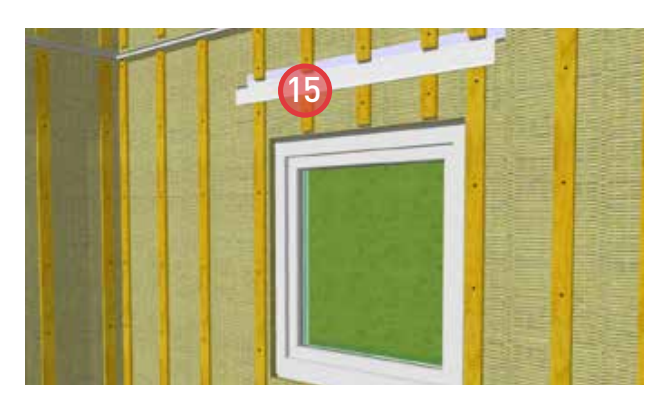
15. Install ROXUL® COMFORTBOARD™ 80 and secure with strapping. Provide bugscreens at the top and bottom of the strapping.