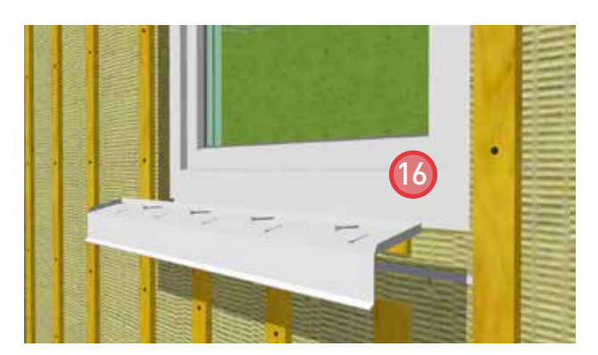
16. Install prefinished metal sill flashing. Attach the sill flashing to the nailing flange under the window sill.