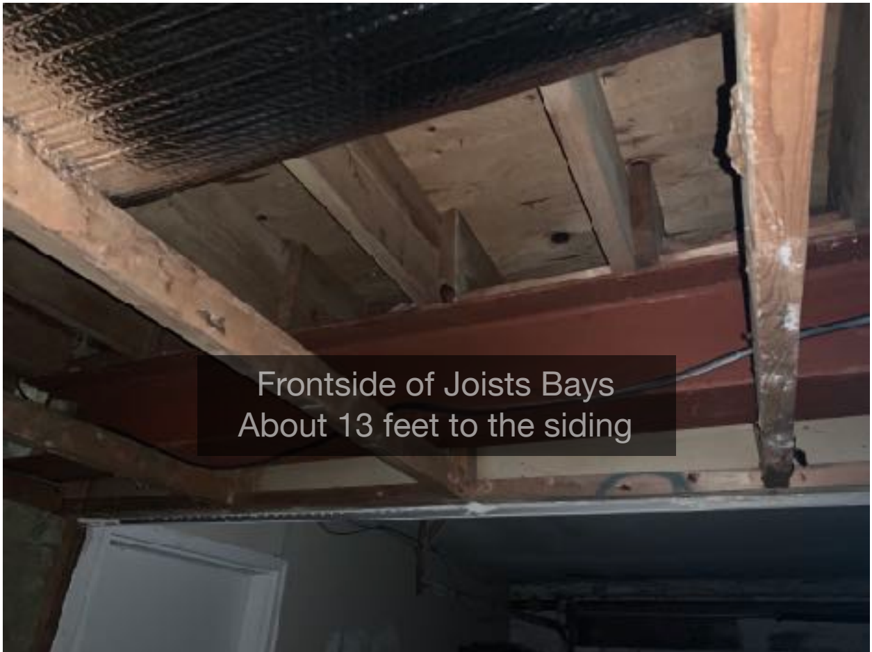
Frontside of Joists Bays About 13 feet to the siding