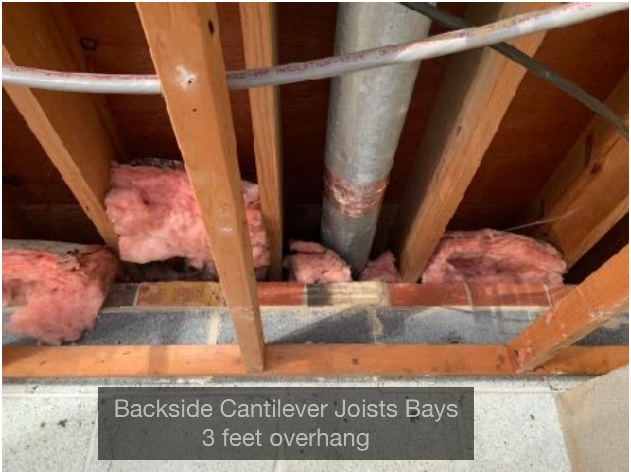
Backside Cantilever Joists Bays 3 feet overhang