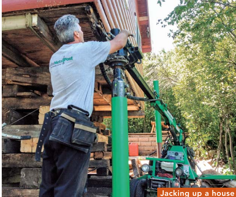
Jacking up a house