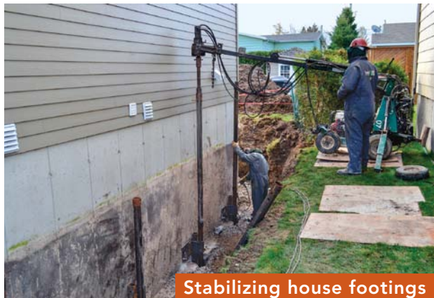
Stabilizing house footings

Helical piles are versatile, and the smaller machines can even retrofit footings inside an existing house.