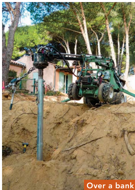
Over a bank