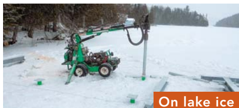
On lake ice