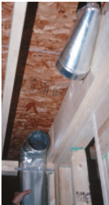
Figure 4. Because this is a fresh-air duct, the crimped end of the duct points toward the stackhead. The photo shows two styles of 90-degree ells that can be used to make the transition from oval duct to round: the ell at the top of the photo is a longways ell, while the ell at the bottom is a shortways ell.