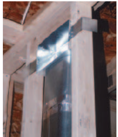
Figure 3. Each wall-mounted fresh-air and stale-air register requires a rectangular duct fitting called a stackhead. Stackheads are installed \frac{1}{2} inch proud of the joists, like electrical boxes.

Stackheads are installed \frac{1}{2} inch proud of the studs, like electrical boxes (Figure 3). On most jobs, the top of the