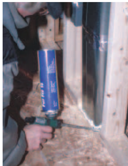
Figure 6. Where an oval duct penetrates a floor, aerosol foam helps secure the stack to the framing.

schedule this part of the work before the siding is on. We use a short (about 6- to 12-inch) section of 6-inch PVC pipe (including a bell end) to connect the insulated flex duct to the vent hood. We cut a series of 1-inch slots, about 1 1/2 inches apart, in the male end of the pipe section, and then slip the flex duct over the PVC. The connection is sealed with aluminum tape and screws. We insert the bell end of the PVC through the hole in the building, flush with the outside face of the trim block. The Jenn-Air hood is then inserted into the PVC. We always seal the gap where the PVC duct penetrates the building with aerosol foam.