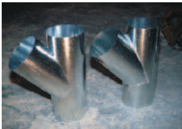
Figure 7. Galvanized #160 wyes come with three uncrimped ends and are crimped as required on site. As purchased (left), the wyes are not airtight, so the seams of each should be sealed with caulk before installation (right).

Since we usually install the vent hoods on trim blocks, we prefer to