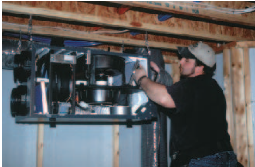
Figure 1. In an HRV with a parallel-plate core, like this model from Venmar, the incoming fresh air passes through every other layer of the core, which is composed of stacked air channels separated by thin plates of plastic or aluminum. The exhaust air also passes through every other layer in the core. Although there is no mixing of the airstreams, heat is transferred from one airstream to the other.

A balanced ventilation system requires careful attention to duct sealing