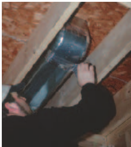
Figure 5. Ventilation systems remove relatively small volumes of air, so ducts should be as airtight as possible. All galvanized duct connections should be secured with sheet-metal screws and aluminum tape.

stackhead is installed about 4½ inches down from the top of the wall. If the room will receive crown molding, we install the stackhead lower.