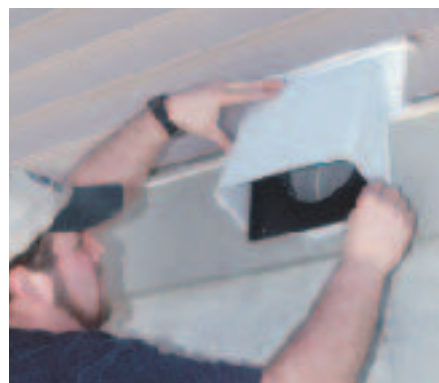
Figure 8. An HRV system requires two exterior ports, an intake port and an exhaust port. These identical 6-inch ports are protected by vent hoods and are usually located at the rim joist.