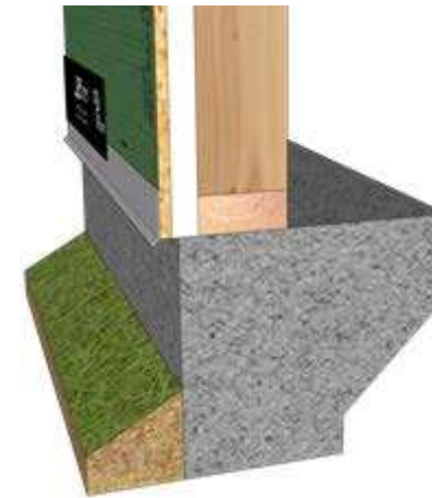
Scenario 4: OSB/foam connection flush with foundation. Min. 1/2" gap between OSB and foundation.