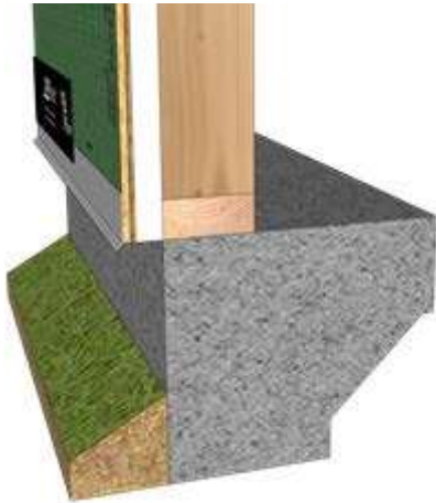
Scenario 1: Back of foam flush with foundation.

There are many ways the ZIP System® R-sheathing can interact with the foundation. Below are four scenarios, but other options may be viable. For alternative flashing options, see the next page. Follow IRC and IBC separation of WSP to top of finished grade.