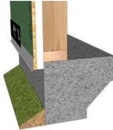
Scenario 2: Foam over hangs the foundation.