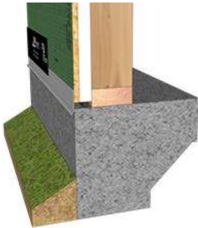
Scenario 3: OSB flush with foundation. Min. 1/2" gap between OSB and foundation.