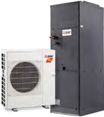
Style of SVZ/PVA