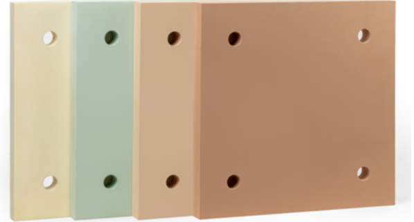
Armatherm™ 500 Series

Armatherm™ 500 is a high strength, polyurethane material made in several densities to support a wide range of loading conditions. Due to its closed cell structure, it does not absorb water or moisture and has limited creep under continuous load.